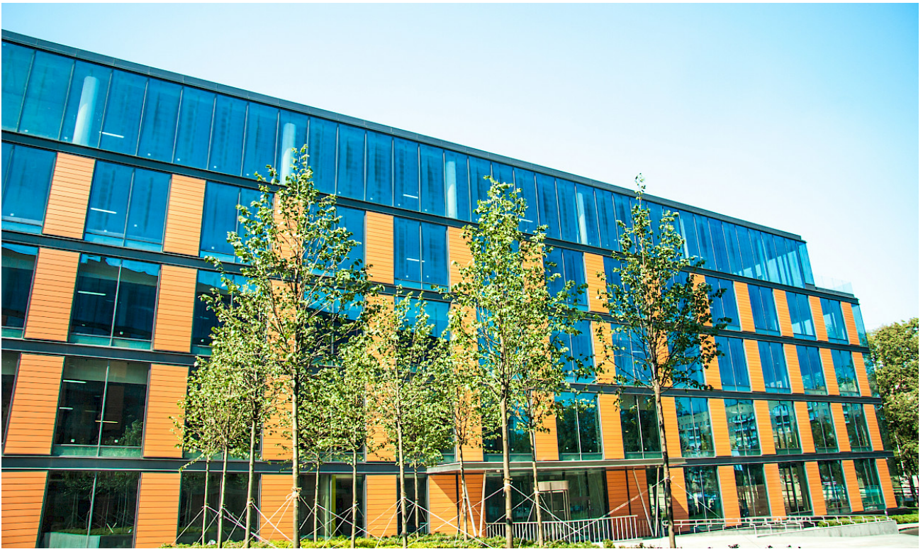
Characteristics of a building in the harmonious-modern category: functional with an understated design