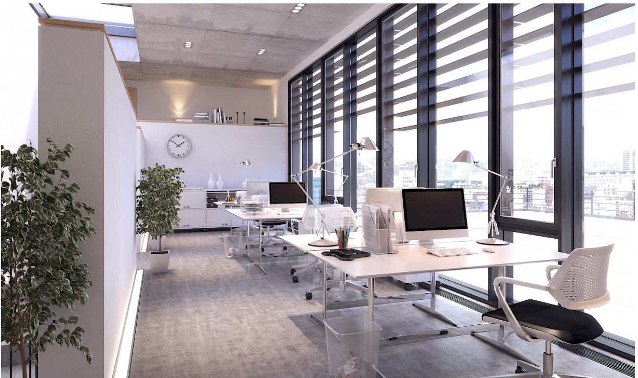
Characteristics of the furnishings in the harmonious-modern category: an oasis of well-being